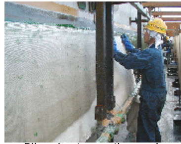
Fiber sheet mounting work (horizontal beam end)