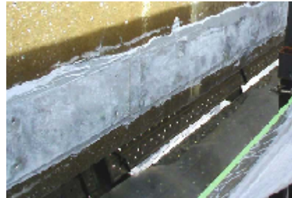
Setting band steel plate for finish ( horizontal beam end )