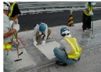
Fiber sheet mounting work (floor-slab upper surface part)